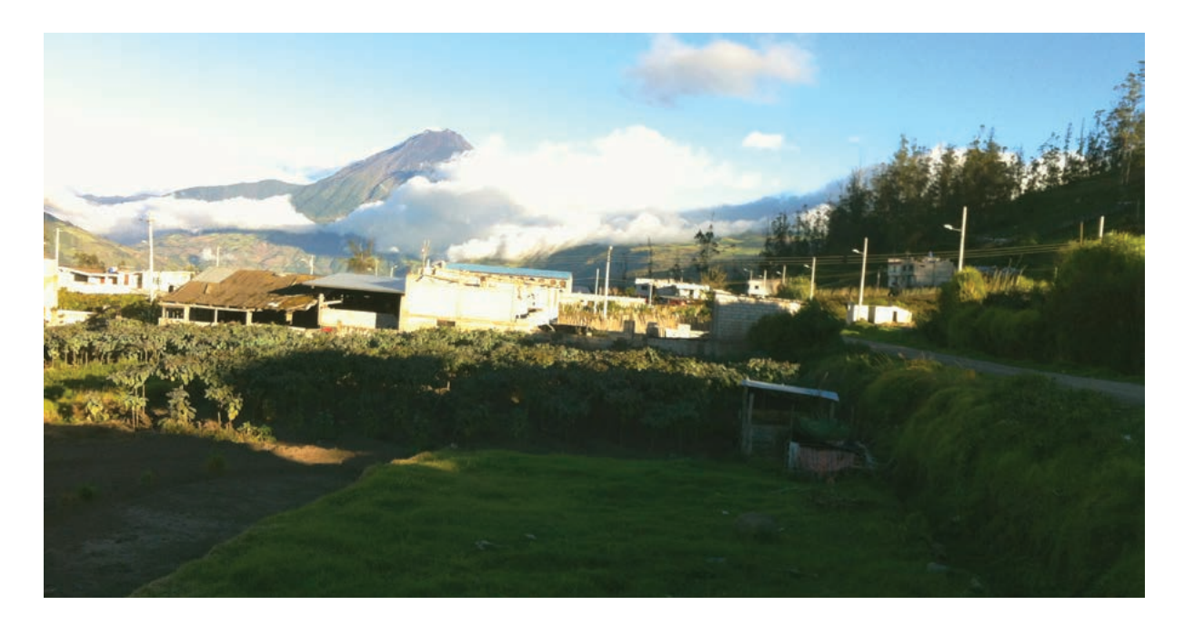
Tungurahua volcano, Ecuador, which became active in 1999 with subsequent eruptions in 2006, 2010, 2012 and 2013.

includes development planning decisions and investments that are risk-sensitive. The concept of disaster resilience refers to the capacity of socio-ecological systems to anticipate, resist, absorb, withstand, manage or maintain certain basic functions and structures, and recover from different hazards; as well as the ability to transform living standards in the face of