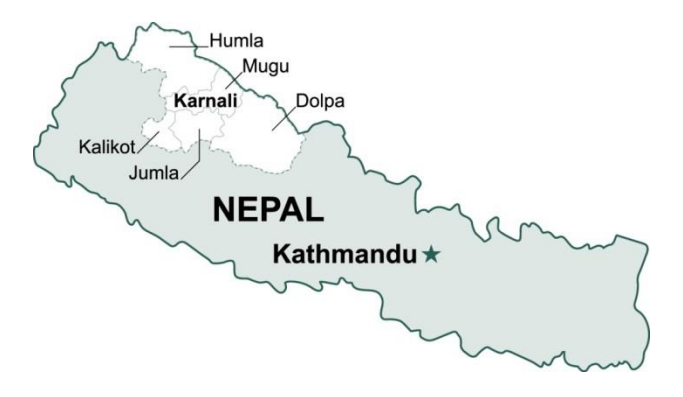
Figure 1: The location of Karnali region

these interventions is the Child Grant, launched by the government of Nepal in 2009.