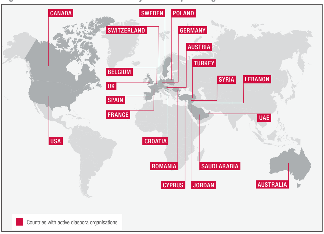
Figure 2: Countries with active Syrian diaspora organisations

The adjective 'local' covers a wide and diverse array of actors, some of them not really 'local' at all, and the distinction between local and diaspora groups is not easily made. The category can denote professional bodies that existed before the outbreak of the war, such as medical associations now providing emergency relief; charities; networks of anti-government and community activists, which have morphed from protest movements into relief providers; diaspora organisations; coordination networks; and fighting groups engaged in aid delivery. The Syrian British Medical Society (SBMS), for example, was established in 2007 by British medical professionals of Syrian descent and focused initially on fostering academic links, promoting standards among British-Syrian healthcare professionals and establishing contacts with other associations (SBMS, 2007) before it became active in providing medical training and relief in Syria.