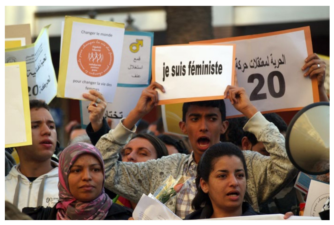
Rally at International Women's Day 2011 in Rabat, Morocco.

Reform is being hampered by institutional failures. The judiciary is not committed to upholding women's rights, and women's access to justice is further hampered by an ineffective and highly variable family division. Corruption also means that a favourable outcome must often be 'bought', which is beyond the means of many women. Local structures of customary power have resisted outcomes benefiting women.