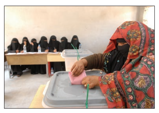
Women's political representation is important, but true gender equity needs a broader approach

Up to 443 million people live in chronic poverty (CPRC, 2008). However, progress on MDG1 (the eradication of extreme poverty and hunger) and MDG7 (ensuring environmental sustainability) has lagged behind that made on some other goals. A lack of sex-disaggregated data masks the gender dynamics of poverty and food insecurity, concealing inequalities between the sexes,