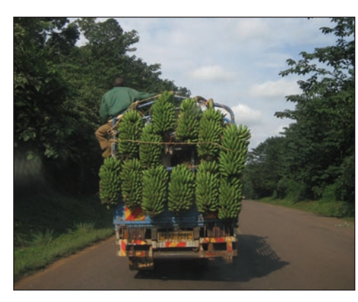
Heading for market: a banana truck in Uganda

This briefing paper aims to do three things. First, it will discuss in broad terms what was on the table in the latest WTO Round and what the latest compromise looked like. Second, it will analyse how such a global compromise would have affected African countries. Countries' (contradictory) interests on subsidies and agricultural protection will be outlined, showing