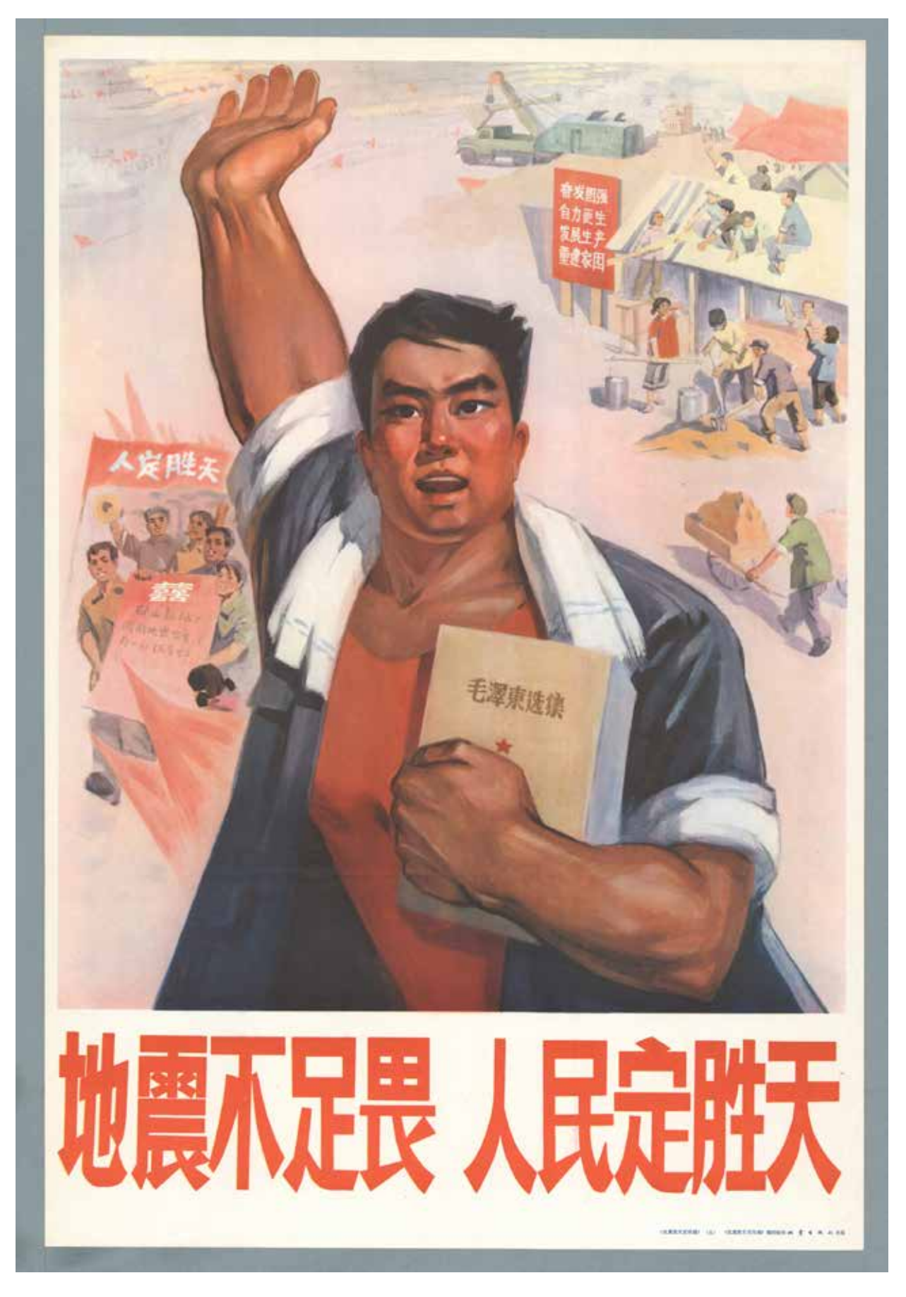
Figure 2: 'Earthquakes cannot frighten us, the people will certainly conquer nature'

Propaganda poster referring to the Tangshan Earthquake, 1976.