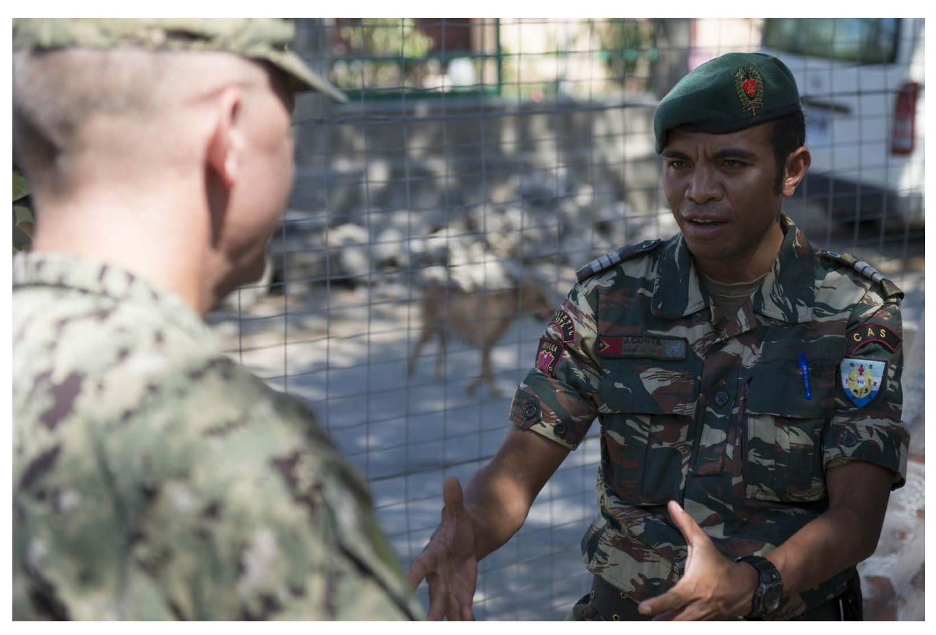
A member of the Timorese Defence Forces.

around 40% of the cash transfer budget on veteran payments. Payments started in 2008, first reaching 2,000 beneficiaries, rising to 64,000 recipients by 2012 (Barma et al., 2014: 265).