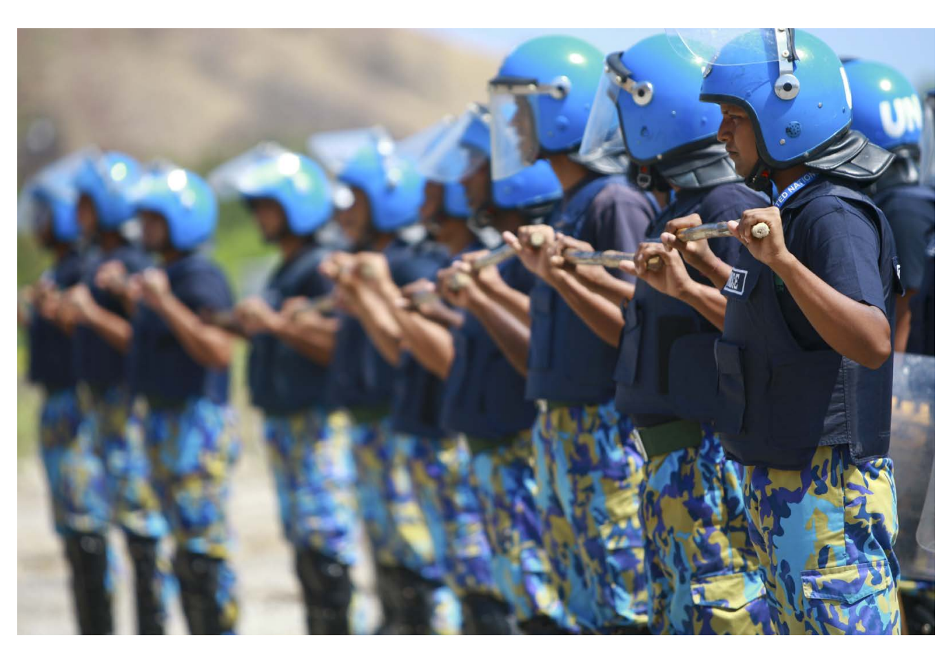
UN and national police training.

The commitment of international actors since 1999 has been an important part of Timor-Leste's progress in security to date, strengthening Timor-Leste's legitimacy as a state and backing it with peacekeeping forces and ample financial resources.