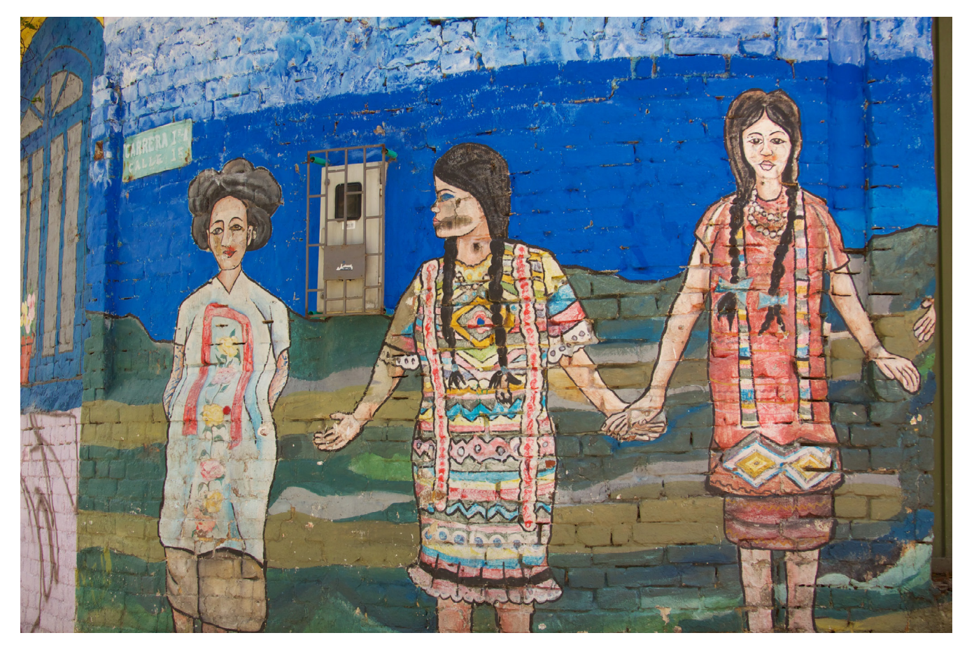
Bogota mural.

Gender-based inequality in human development is deeply entrenched in Colombia, irrespective of the trends in improved indicators relating to education, labour and reproductive health. This inequality moreover intersects in important ways with cleavages related to class, ethnicity, urban-rural divides and the particular political economy of sub-national politics and conflict-related realities. Women's experience of conflict is closely associated with related patterns of exclusion and discrimination. Women who are subjected to conflict-related violence have below average levels of education and are often illiterate (Diaz and Marin, 2013). Among IDPs in particular, overall illiteracy is far higher (29.5%) than the national rate (6.9%) and, among IDPs, women have a higher rate of illiteracy (30.8%) than men (27.9%), highlighting the vulnerability of marginalised and excluded groups to the conflict (Diaz and Marin, 2013). Ethnicity also intersects with gendered vulnerability to conflict: Afro-Colombian and indigenous women are especially vulnerable to conflict-related and gender-based violence (Oxfam GB, 2009). Tellingly, more than 30% of IDPs are Afro-Colombian (Oxfam GB, 2009). Importantly these patterns of exclusion are a reflection