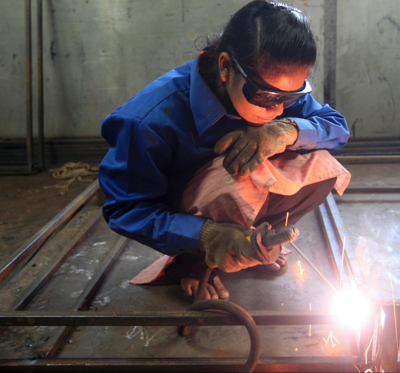
An Asian Development Bank project in Nepal is helping the most disadvantaged women learn trades once reserved for men.