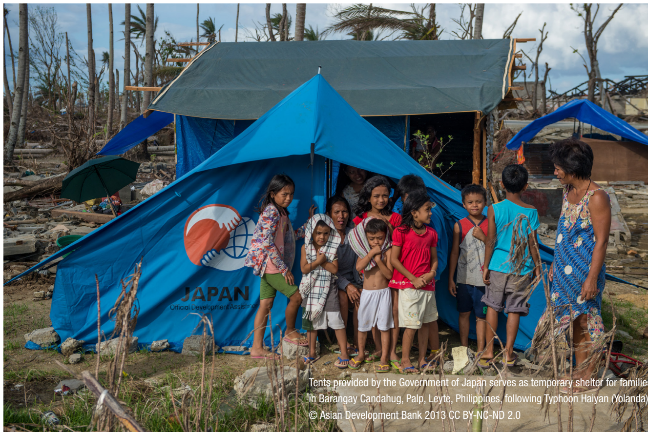
Tents provided by the Government of Japan serves as temporary shelter for families in Barangay Candahug, Palp, Leyte, Philippines, following Typhoon Haiyan (Yolanda)

During or immediately after the occurrence of extreme natural phenomena or conflicts, those at risk generally take action to protect themselves, their families and their neighbours (Kreps, 1984). In many cases, the occurrence of extreme events has been a catalyst to strengthen community bonds and solidarity (Anderson and Woodrow, 1998; Oliver-Smith, 1999) with some studies exploring the effectiveness of social capital (i.e. the function of trust, social norms, participation, and networks) for disaster recovery (Nagakawa and Shaw, 2004). At the same time, disasters have been seen to aggravate pre-existing inequalities by further marginalising already disadvantaged groups. Following Hurricane Katrina in 2005, the ratio of women's to men's earnings in New Orleans declined from 81.6% prior to the disaster to 61.8% in 2006 and intimate-partner violence against women increased (Willinger, 2008). Meanwhile, women inhabiting New Orleans were found to be 2.7 times more likely than men to have Post-Traumatic Stress Disorder (Ibid). Overall, however, post-disaster research lacks insights into social