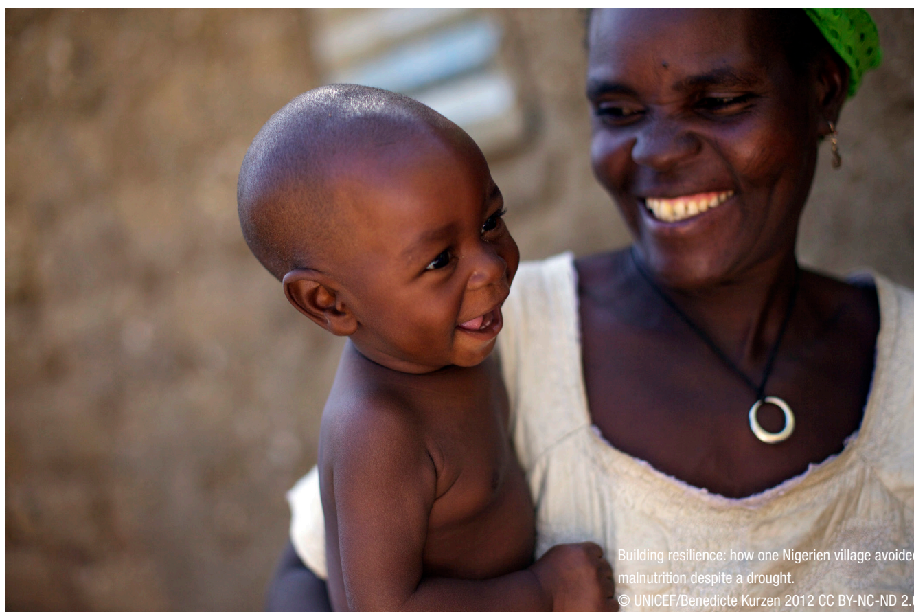
Building resilience: how one Nigerien village avoided malnutrition despite a drought.

A resilience approach which promotes transformation can help practitioners and researchers address some of the root causes of people's vulnerabilities which create disaster risks. It can do so through helping them choose the most appropriate strategy to tackle discriminatory gendered norms and violence in complex settings and through promoting capacity building and social empowerment (Reyes et al., 2013). 5 Whilst addressing gender inequalities remains challenging, there is evidence of success in increasing resilience when gender-sensitive approaches are adopted. For example, attention to women's needs and women's leadership in the peace process is key to resilient and sustainable peace (Faxon et al., 2015). Moreover, the provision of technical skills that do not reproduce traditional roles, when implementing resilience projects at the community level, is one example of a gender-transformative approach that allows women and men to take on new roles and responsibilities. Another example where resilience work can advance gender equality is the rebuilding of housing that is jointly titled in both partner's names (Enarson, 2014) and more generally, reconstruction efforts that avoid rebuilding structures which reproduce