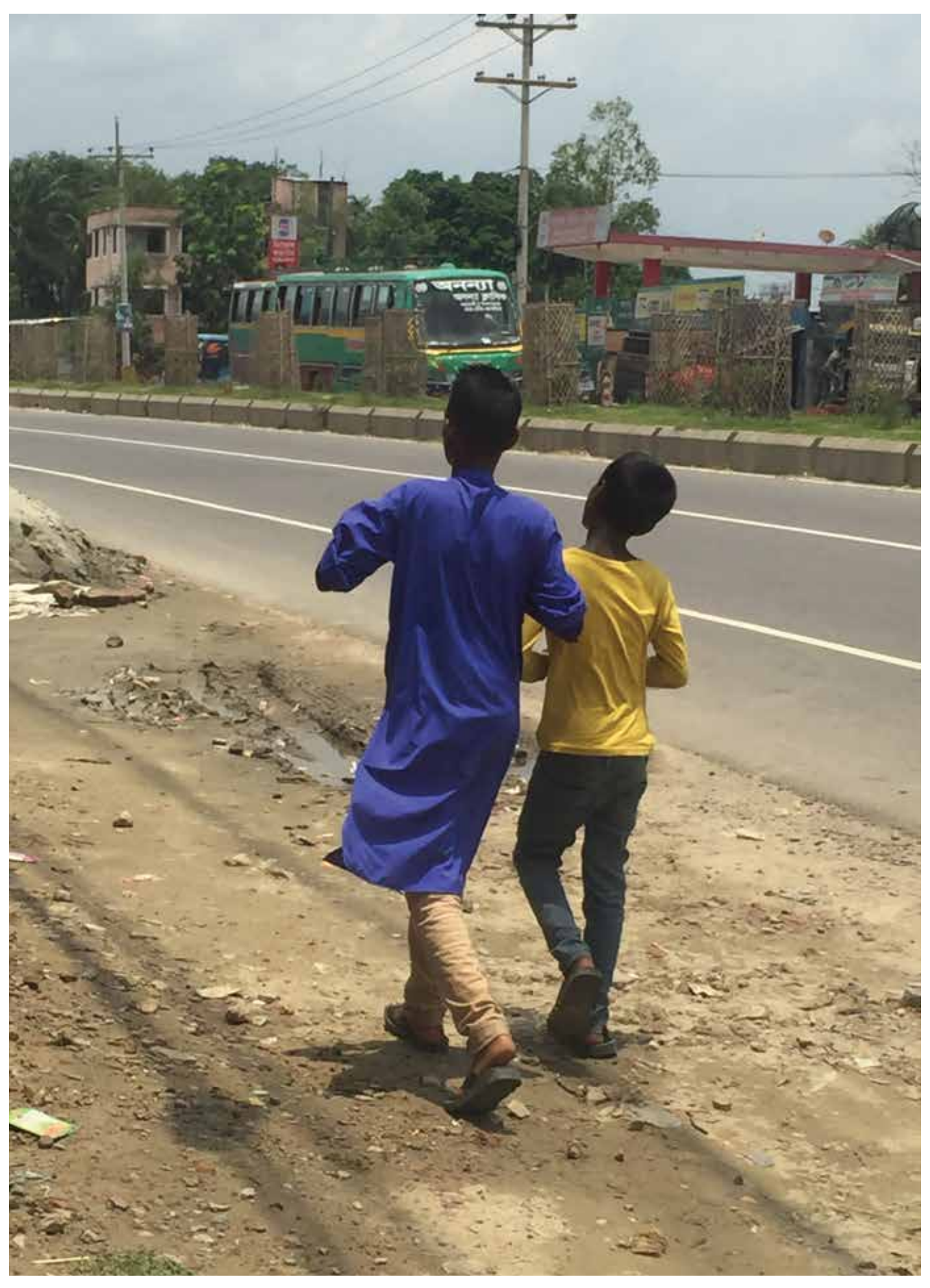
Boys, Bangladesh