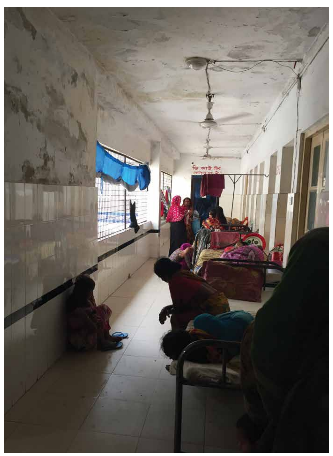
Women's ward, Gazipur hospital, Bangaldesh