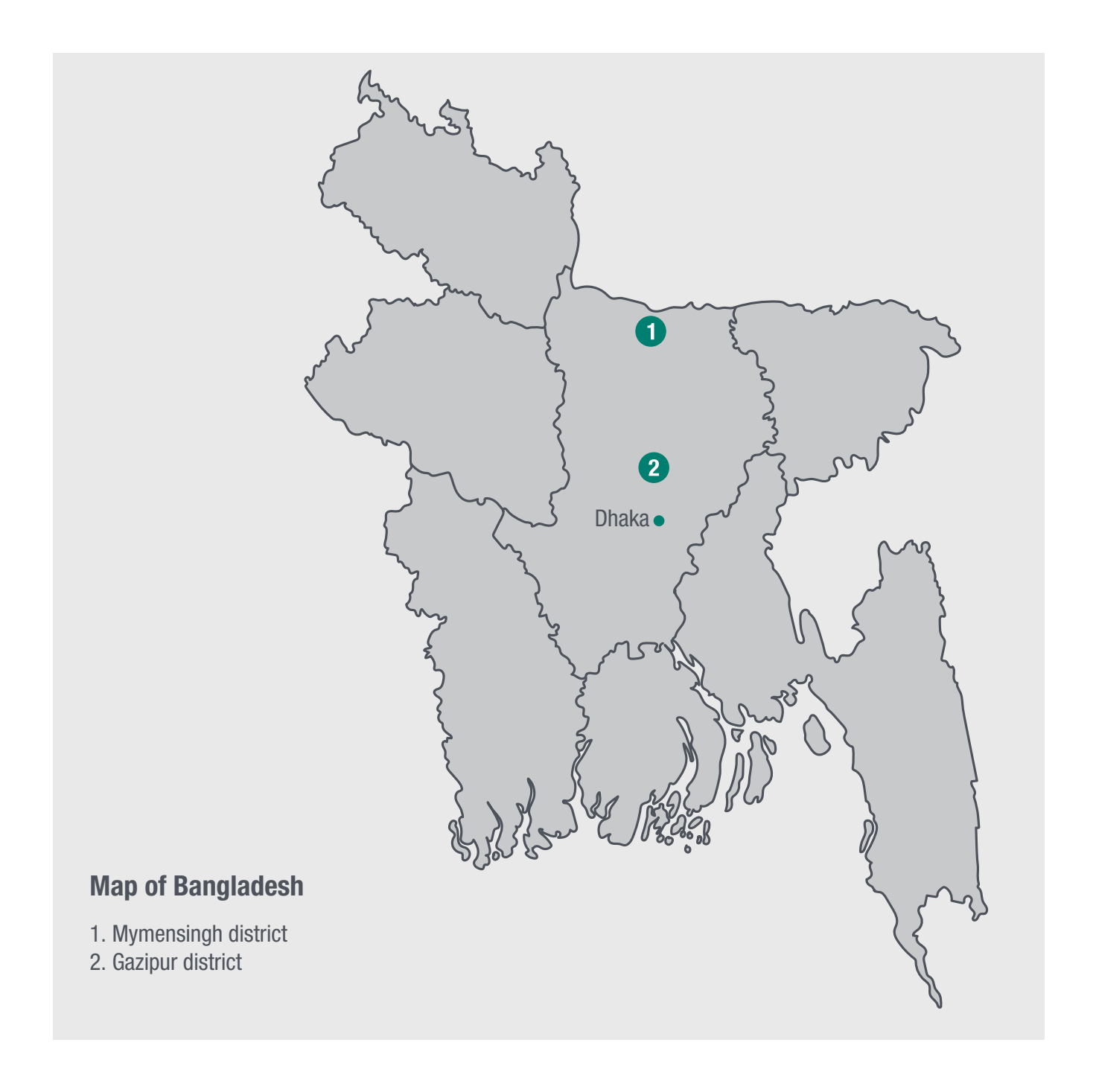
Figure 2: Map of study sites

becoming employed in garment factories located nearby. In Mymensingh, some women are employed as domestic workers. Some women from both districts are self-employed and a few are NGO workers. The proportion of working women is lower in village E compared to the other study villages. Interestingly, there are also overseas migrant workers among women in all of these villages. Migrants usually go to Saudi Arabia, Qatar, Dubai, Jordan, Malaysia, Hong Kong and Lebanon and make an important contribution to their household income.