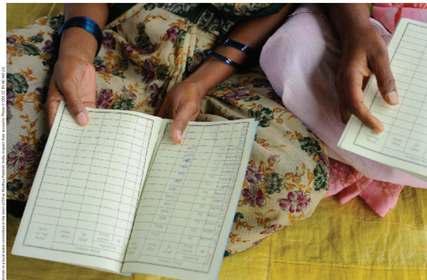
Women in a local water committee in the town of Dhar, Madhya Pradesh, India, inspect their accounts. Photo © ODI. CC BY-NC-ND 2.0.

diaspora investors and business people. They should also develop a toolkit and case studies to assist Commonwealth governments in better understanding and harnessing the potential of Commonwealth diaspora and civil society to spur trade and investment for inclusive development across member countries.