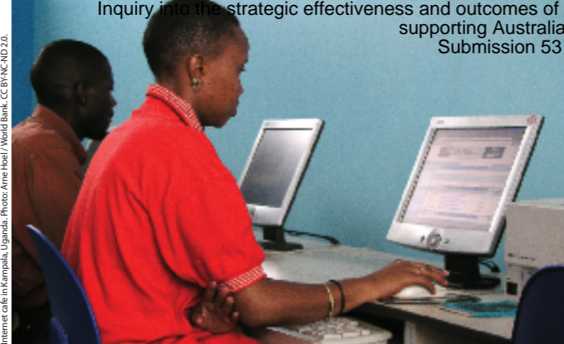
Internet cafe in Kampala, Uganda.

well as improvements in standardisation and product quality. Imports, on the other hand, help developing countries to access technology, import a greater variety of products and raise competition, which can promote further upgrading of firm-level capabilities and choice for consumers.