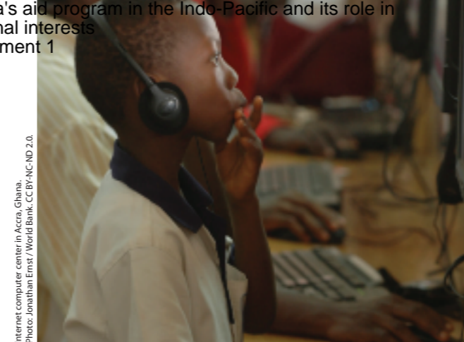
Internet computer center in Accra, Ghana. Photo: Jonathan Emst / World Bank. CC BY-NC-ND 2.0.

According to the International Telecommunications Union, 95% of the world's population is covered by a mobile-cellular network, yet the networks only reach 67% of the rural population. 25 Despite the rapid dissemination of digital technology globally, 53% of the world's population does not yet use the Internet. In LDCs, only 1 in 7 people are using the internet and the gender gap between male and female users is significant, at 31%. Broadband affordability is a key issue