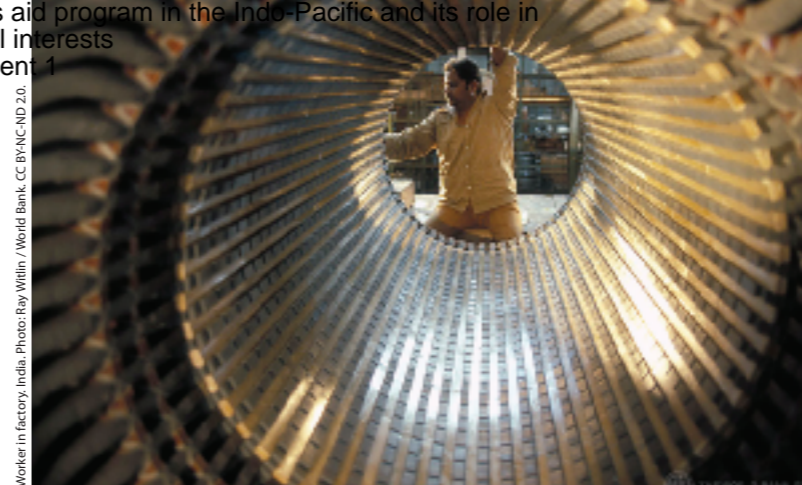
Worker in factory, India.