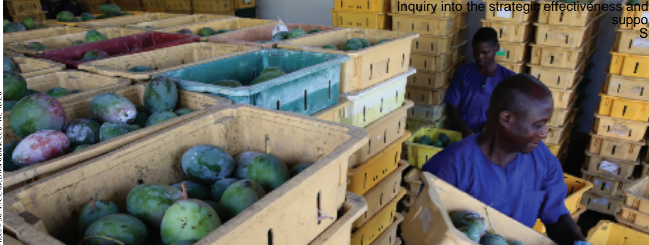
Factory workers producing fresh fruit drinks in Nawan District, Ghana. Photo © Dominic Chavez/World Bank. CC BY-NC-ND 2.0.