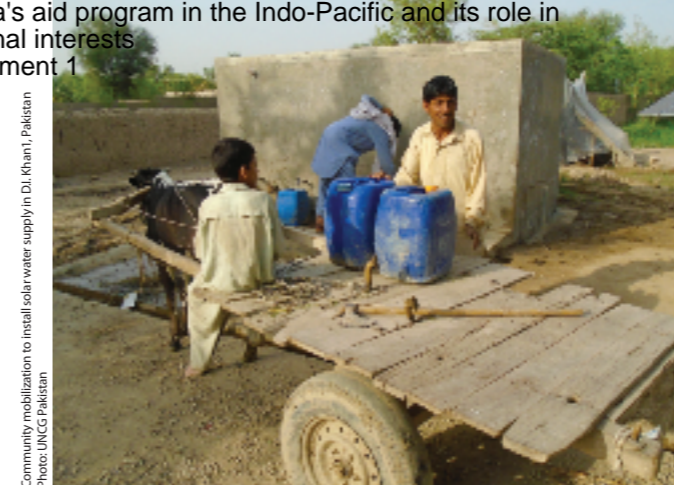
Community mobilization to install solar water supply in D.I. Khan, Pakistan

The March 2017 CTMM saw the establishment of a Connectivity Agenda , which focuses on issues of physical, digital, regulatory, business-to-business