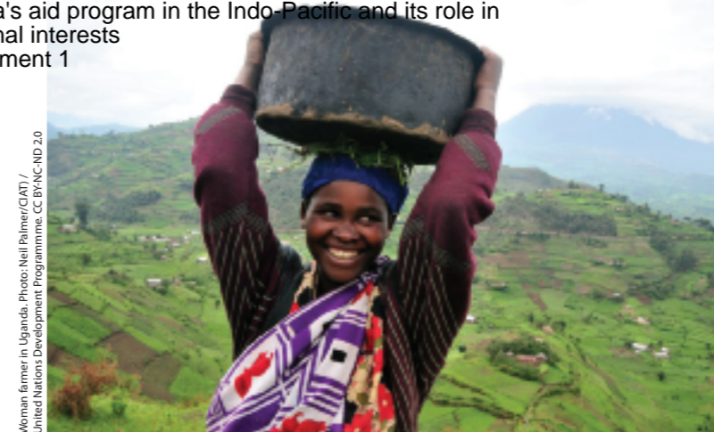
Woman farmer in Uganda.

The nature of the Commonwealth means that it is uniquely placed to provide intra-Commonwealth business networks for young business owners. Developing skills of young entrepreneurs would contribute towards achieving SDG 4, building their potential to establish new businesses, succeed in exporting and create new jobs for others. The Commonwealth can provide a platform to provide tailored advice and support to young entrepreneurial business owners from across its network of Commonwealth business support organisations, capitalising on the 'network-of-networks' setup of the Commonwealth. This platform could be mobilised through CWEIC and partners like ITC and the Tony Elumelu Foundation of Nigeria. 56 The creation of a new Commonwealth Young Entrepreneurship programme, would provide knowledge and tools, and would connect