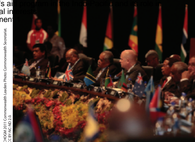
CHOGM 2011 Commonwealth Leaders

According to the latest available Commonwealth Trade Review produced by the Commonwealth Secretariat, intra-Commonwealth trade in goods in 2015 was estimated at $525 billion. This represents average growth of almost 10% each year since 1995. Notably, it is the Commonwealth's developing country members, particularly in Asia and to a lesser extent Africa, who have been major beneficiaries of this expansion.