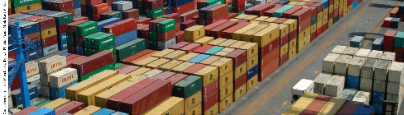
Container terminal, Mombasa, Kenya.

goods. Without investment to upscale domestic industry, countries like the Solomon Islands will struggle to add value to the natural resources at their disposal and leverage the blue economy. 30