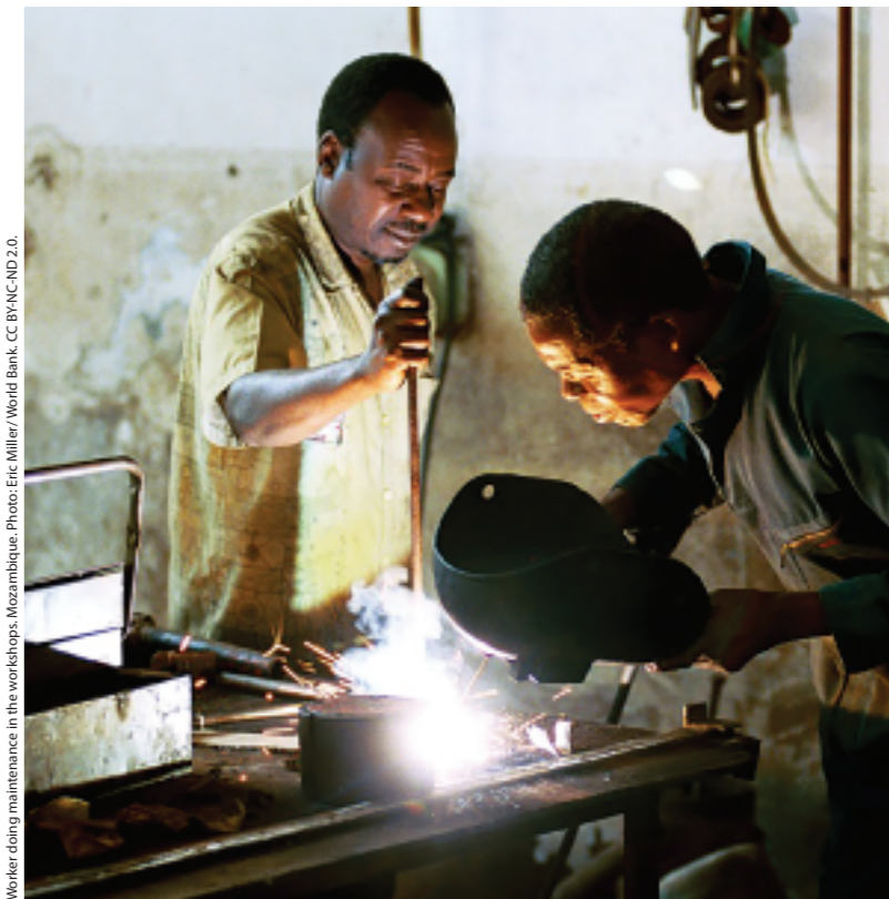
Worker doing maintenance in the workshops. Mozambique.

In Part 4 of our Report, we set out a road-map of next steps, focusing on how the Commonwealth can make this agenda happen and turn potential into reality. We lay out detailed guidelines for a High-Level Task Force to draw-up the work programme, governance and working processes over the first two years following the Commonwealth Heads of Government Meeting (CHOGM) 2018, calling on Commonwealth leaders to establish the political direction and mandate. We also look ahead to the milestone of CHOGM 2020 in Malaysia, which we believe can serve as a platform for taking stock of progress achieved, reviewing lessons-learned,