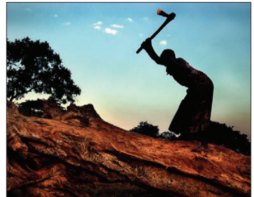
Despite the feminisation of poverty, most of the MDGs are 'gender blind'

It is clear that performance on the MDGs is mixed – with some countries doing very well, others less so, and a few doing badly. In general, sub-Saharan Africa is lagging behind on all the goals, and South Asia on those relating to human development. However, seeing the lack of progress as a particularly 'African' problem is misleading. Most of the poor live in South Asia (CPRC, 2008) and many are in large middle-income countries. Then there are specific MDG targets that are proving hard to reach in many developing countries.