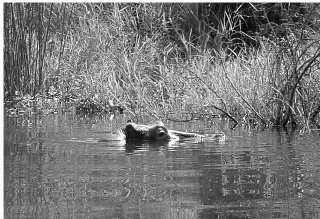
Wildlife in Malawi. ‘As the rich world gets richer, the demand for travel to destinations in Africa is projected to increase’.

First, Africa’s 4% of global international arrivals (and 3.7% of receipts) is a success given the marginalisation of Africa in the global economy – with less than 2% of global exports. The