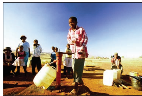
Progress towards harmonisation and alignment in the water sector could be faster

sector policies and systems with strengthening implementation capacity, to create the conditions for achieving concrete gains in poverty reduction. This will, however, require partnerships that reach beyond recipient country capital cities.