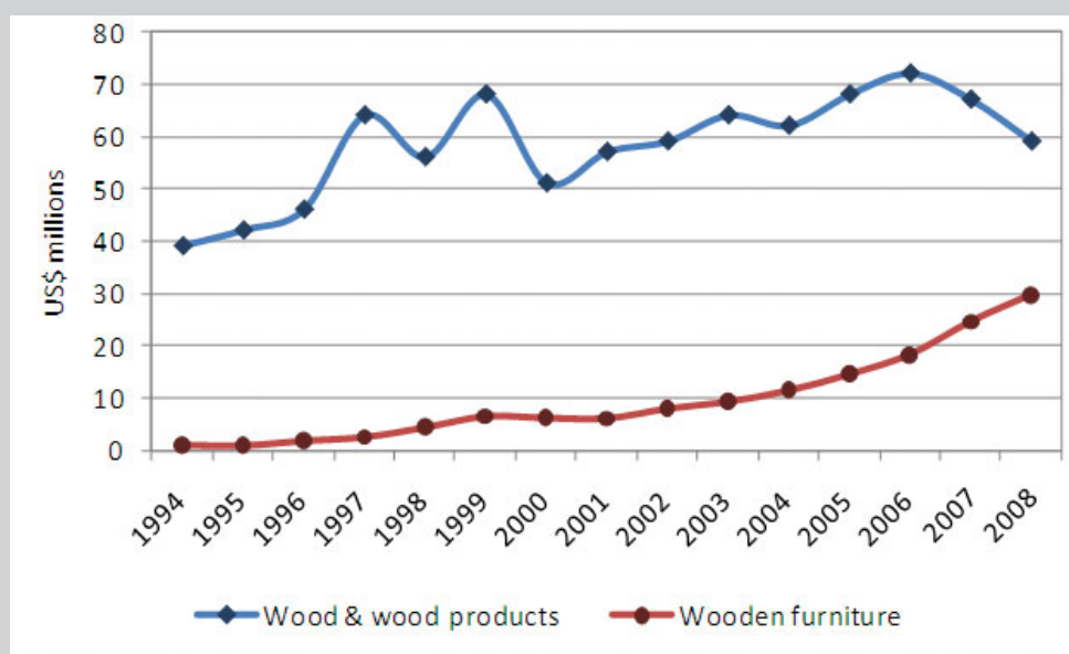
Figure 1: Exports of wood and wood products from Honduras, 1994-2008

Source: Sistema de Estadísticas de Comercio de Centroamérica (2009). Data for 2008 are preliminary.