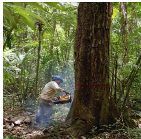
Can risks for investors in REDD be reduced in a way that is in the interests of the poor?

Investment in reduced emissions from deforestation and degradation (REDD) in developing countries relies on the ability to guarantee effective maintenance of forest cover over long timeframes, while also avoiding negative social and environmental repercussions. Given the complex and often unpredictable drivers of deforestation in developing countries, risk reduction is therefore of paramount importance. This paper looks at how REDD transaction mechanisms between buyers and sellers might be established and the implications that risk reduction mechanisms might have for different stakeholders in developing countries. It focuses on the likely implications for the interests and welfare of the forest-dependent poor.