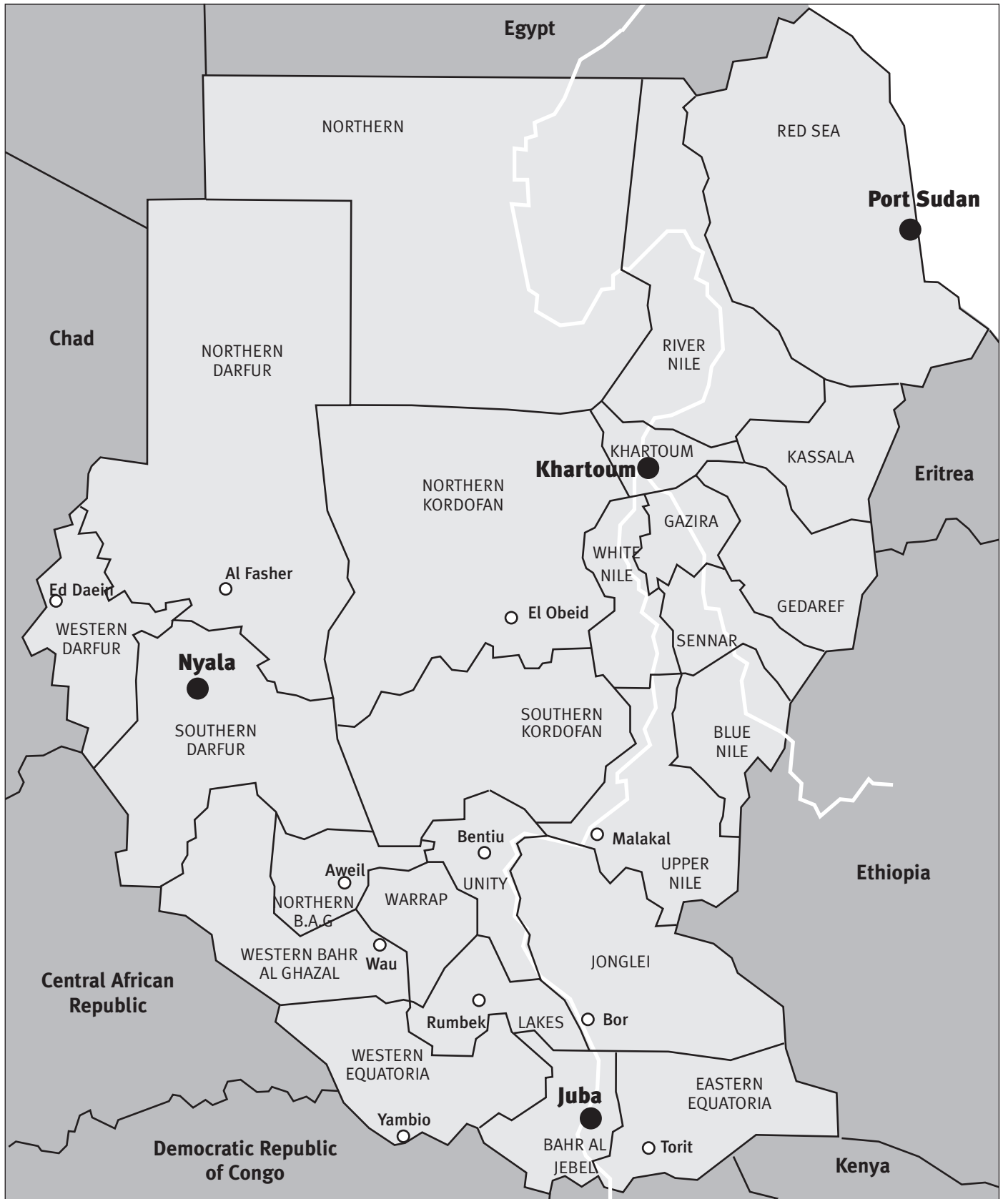
Figure 1: Map of Sudan