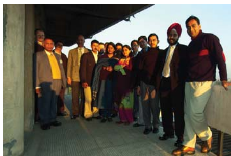
Participants at the groundwater workshop in India

Influencing policy change is an art as much as a science, but there are a wide range of tools that can provide powerful