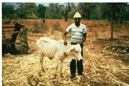
A community-based veterinarian in India

The framework helps illuminate the errors made. NGOs developing and testing the community-based approaches should have understood the policy context and worked more closely with veterinary policy makers earlier on. They should have collected more empirical data to prove the value and effectiveness of their approach, and to refute concerns that community-based services are unprofessional or threatened the veterinary privatisation programme. A campaign, using this evidence, could have convinced policy makers of the