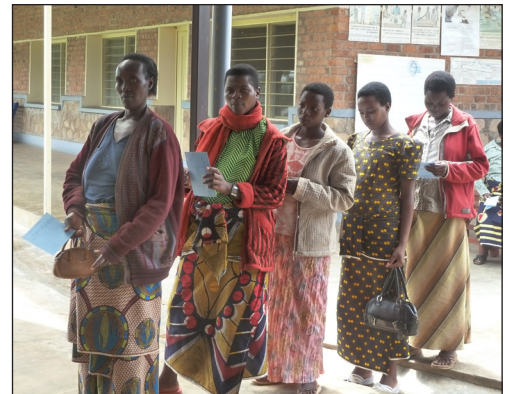
High numbers of expectant mothers are attending pre-natal consultations in Rwanda.

S afe motherhood is a key objective for developing countries but, despite recent improvements, sub-Saharan Africa is still the most dangerous place in the world to give birth. This Briefing Paper uses new research by the Africa Power and Politics Programme (APPP) to explore the factors that shape maternal health outcomes in Malawi, Niger, Rwanda and Uganda. It examines the institutional causes of bottlenecks in the provision of maternal health services and considers the policy implications for country actors and donors.