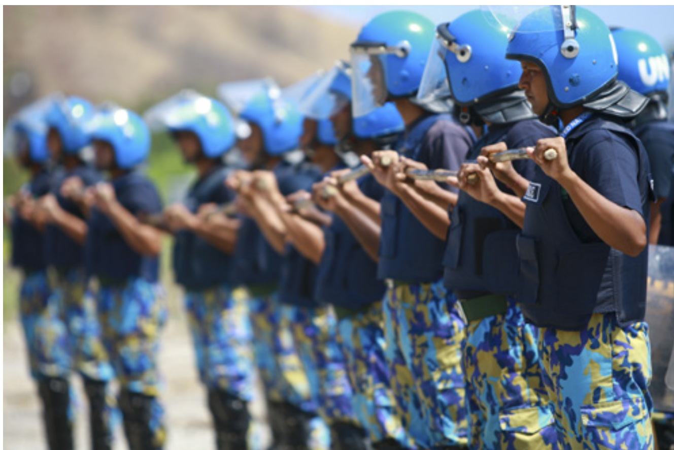
UN and national police training.

The commitment of international actors since 1999 has been an important part of Timor-Leste’s progress in security to date, strengthening Timor-Leste’s legitimacy as a state and backing it with peacekeeping forces and ample financial resources.