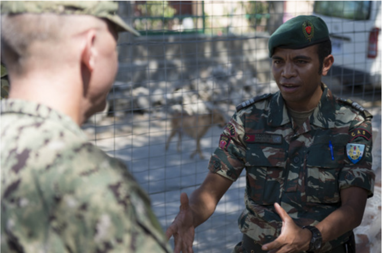
A member of the Timorese Defence Forces.

around 40% of the cash transfer budget on veteran payments. Payments started in 2008, first reaching 2,000 beneficiaries, rising to 64,000 recipients by 2012 (Barma et al., 2014: 265).